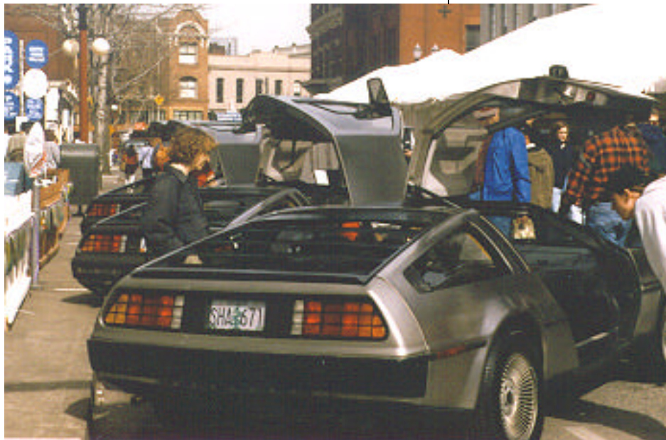
Another day in the limelight

When not sharing war stories and troubleshooting ideas, some ideas for club events and procedures were covered. Ideas centered on ways to spur participation by varying the nature of the events to better cover the interests of a broader cross section of members. In addition to the BBQ and troubleshooting event which usually receives good attendance, and the larger auto related events in the community like the All British Field Meet, we will be adding events like a club golf outing and participation in the IPD Volvo parts discount bazaar at their garage sale. Suggestions for other events or interests is always welcome and assistance in making suitable arrangements and preparations is appreciated. See the events calendar at the end of this issue for our preliminary events schedule for the year. Some of the events will be refined over the next few weeks as the details are worked out.